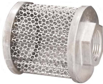
INTERNALLY MOUNTED PMI Series