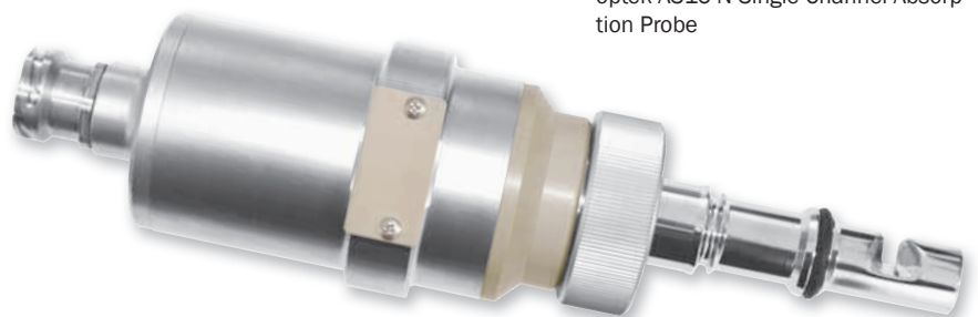
optek AS16-VB-N Single Channel Absorption Probe with Calibration Option