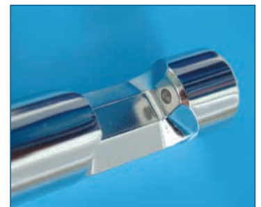
optek AS16-N Single Channel Absorption Probe

See our TOP 5 brochures for applications in your industry.