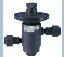
Vacuum safety valve

FLEXIBLE CONFIGURATIONS: THE V10K™ GAS FEED SYSTEM IS AVAILABLE IN DIFFERENT DESIGNS