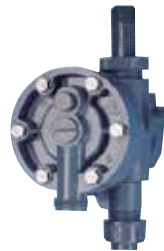
1" injector up to 10 kg/h Cl 2