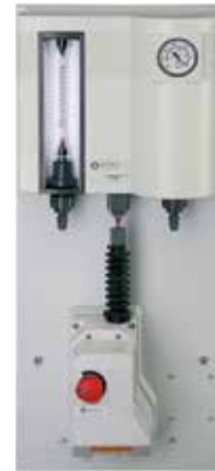
V10k Automatic system