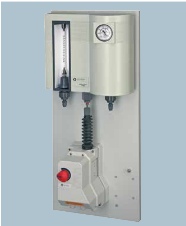
PRE-ASSEMBLED INSTALLATION OF THE V10K AUTOMATIC SYSTEM

The SFC PC process controller saves its responses related to control deviations and uses this data for future control calculations. So the actuating control output is optimized by fast reaction on flow value and continuously adjusted control parameters through memory data.