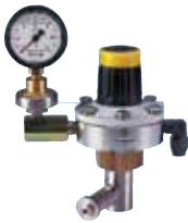
4 kg/h vacuum regulator