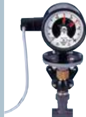
vacuum contact pressure gauge