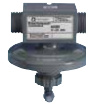
Safety vent valve