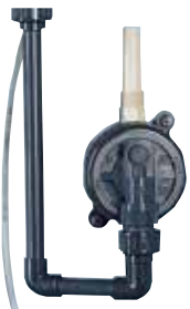
3/4" injector up to 4 kg/h Cl 2