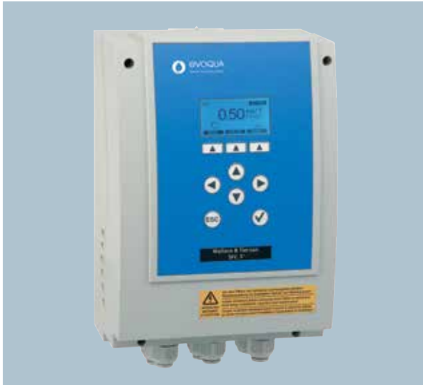
SFC MEASUREMENT AND CONTROL SYSTEM

With the V10k™ system the following control modes are available: