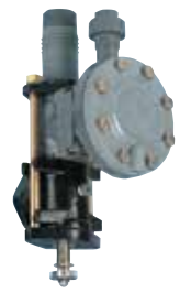
2" injector up to 15 kg/h Cl 2