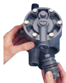
1" injector up to 10 kg/h Cl 2 anti-syphon