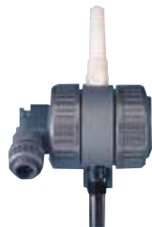
3/4" injector up to 4 kg/h Cl 2 anti-syphon