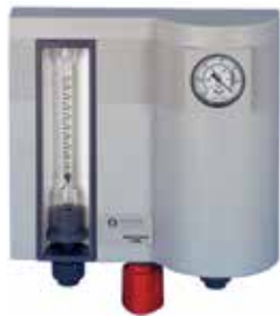
V10k manual system