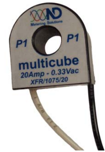
Ring Sensor 20, 40 or 60 Amp

With a safe low voltage output, there are no worries about open-circuiting CT secondary circuits.