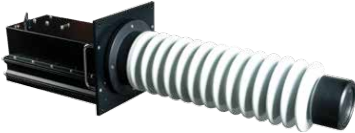
960W and 480W Models

150 - 1000W, 80 - 150kV versatile PSU range