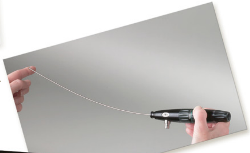
Semi-Rigid Micro Borescope