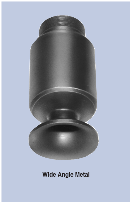
Wide Angle Metal