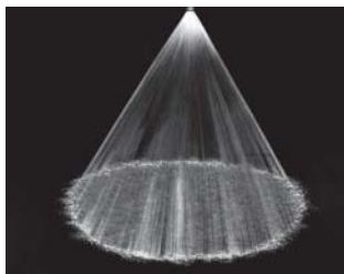
Full Cone 60° (N)