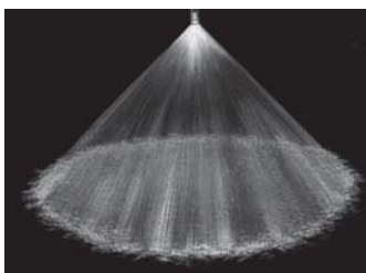
Full Cone 90° (M)