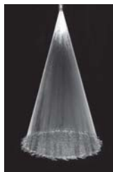
Full Cone 30° (NN)