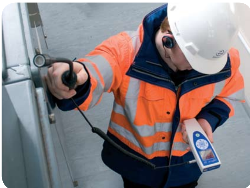
Optional external microphone extends reach.