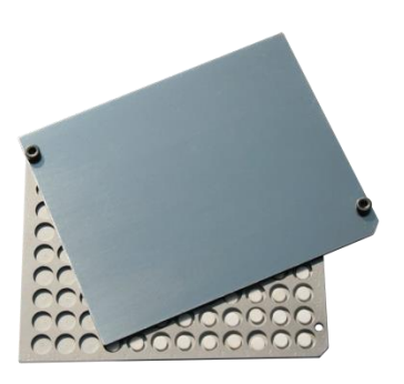
Annealing tray for 120 TLD elements, stainless steel with cover