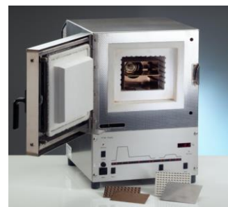
Programmable TLD Oven