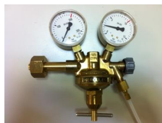
N 2 gas pressure reducer, metric