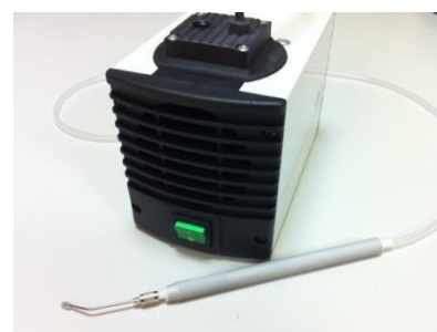
Vacuum Tweezers incl. Vacuum Pump