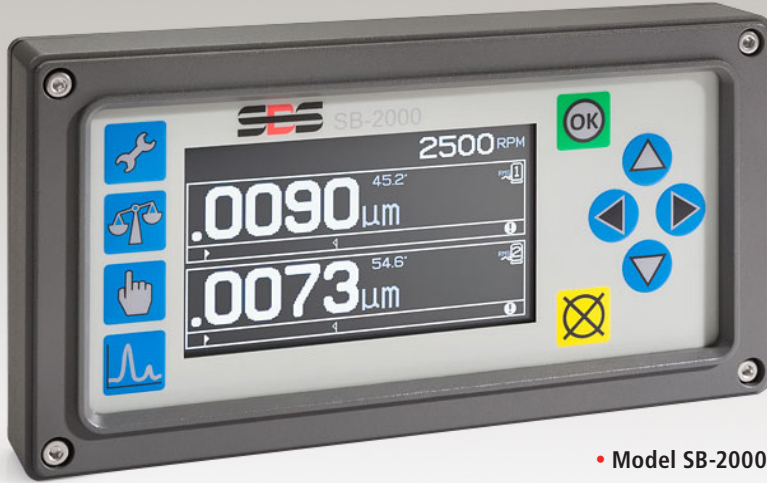
• Model SB-2000