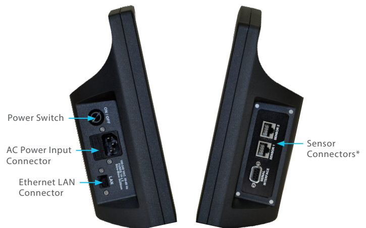
MODEL 4421A Side Views

The 4421A is the next generation replacement for the industry standard Model 4421. Building upon the original model's high level of accuracy and its ease of use, the new 4421A enhances the meter's functionality by utilizing a smaller/lighter design, and by providing the ability to have dual sensor inputs.