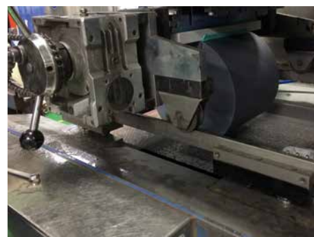
Easy operation for higher yield