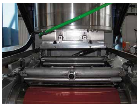
Perfect alignment for highest precision