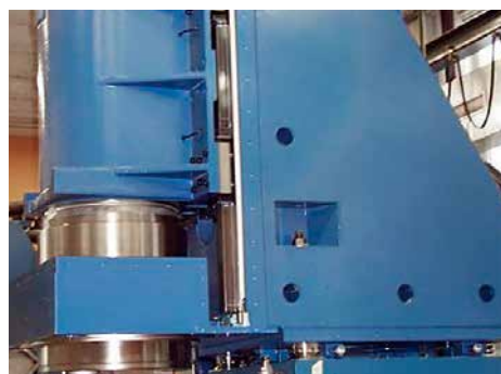
Robust design for lowest warp