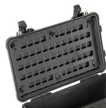
1510MP EZ-Click™ MOLLE Panel