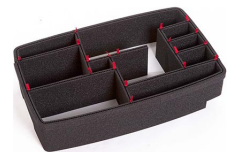
1510EUTP TrekPak Case Divider Kit