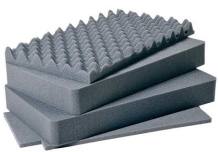
1511 4 pc. Replacement Foam Set