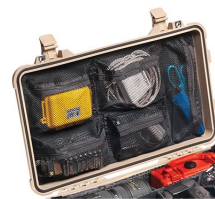
1519 Lid Organizer