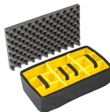
1515 Padded Divider Set