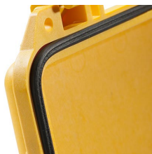
1513 Replacement O-ring