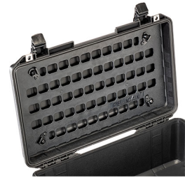
1535MP EZ-Click™ MOLLE Panel