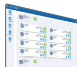
Multi-user interface EXFO Multilink