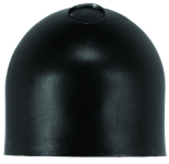
6LV1352 Light Shield Accessory for EK4036S, EK4436SM, K4000 Series Button Photocontrols