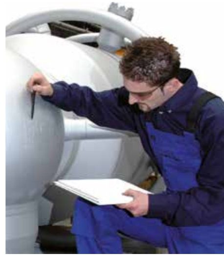
We combine our decades of experience, expertise and, knowledge to satisfy the demands that our customers place on us

The DAK valve replaces these gate valves and the manifold to integrate all those functions in one single valve. This design improve the steam flow, reducing the pressure drop and thus improving the overall efficiency of the plant.