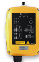
Flex EX 4/6 Receiver