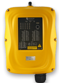
Flex EX 8/12 Receiver