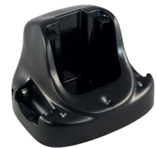
Charging Cradle Available For Easy Recharge