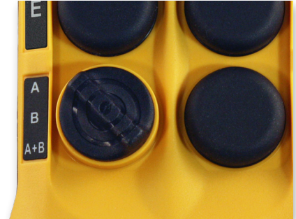
Selector Switch Available on A/B and Tandem Models

Flex EX2 receivers were designed with field installation and serviceability in mind. Receivers come prewired with 6' of cable and mounting hardware allowing fast installation. Onboard diagnostic and output LEDs provide useful system status information when installing and troubleshooting. All components are easily accessible and field replaceable.