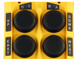
Labels Located Next To Buttons For Easy Visibility and Durability