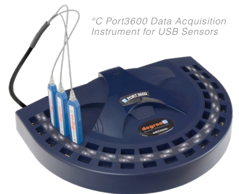
°C Port3600 Data Acquisition Instrument for USB Sensors