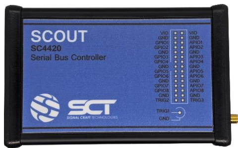
Scout – The standard in SPMI, RFFE and I3C Bus Masters

The SC4420 is a third-generation device in the Scout family. It is designed to be fit, form and function compatible with the SC4415. Scout is the highest performing MIPI controller on the market. Unlike other USB-based serial bus dongles, Scout products are designed for high-speed test and control applications. Architected around an FPGA, the SC4420 ensures that all timing and control functions are deterministic. The device is targeted at verification benches and high-volume production test applications requiring reliable operation over millions of test sequences.