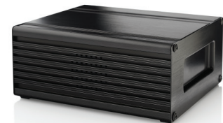
Radio Transceiver + Alfatronix Desktop Power Supply + Alfatronix Battery Back Up Box