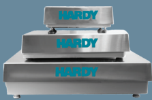
Hardy Bench Scales