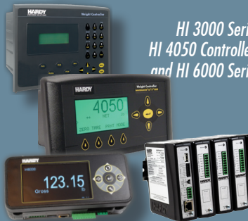
HI 3000 Series HI 4050 Controllers and HI 6000 Series