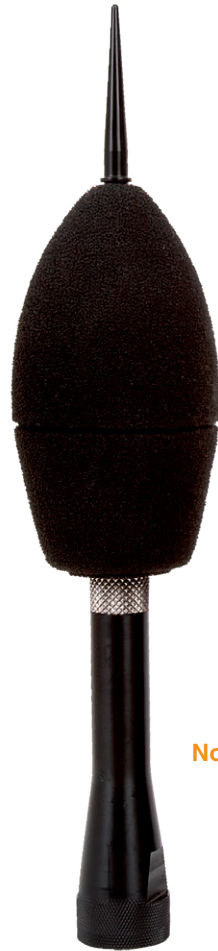
Nor1216 / Nor1217 Outdoor Microphone