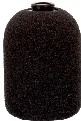
Nor1297 Noise compass