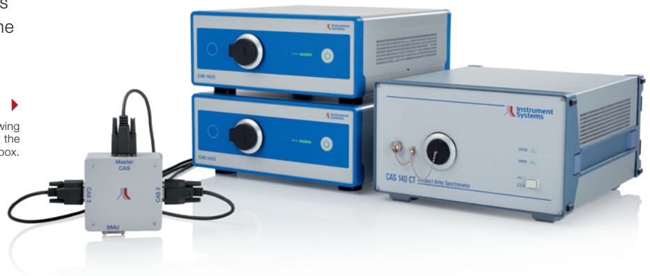
Example MultiCAS measurement setup showing two CAS 140D, one CAS 140CT and the MultiCAS hardware trigger box.

The additional MultiCAS hardware trigger box ensures that the spectrometers are activated synchronously. The software application SpecWin Pro automatically combines the individual spectra into a total spectrum. An additional step within the factory calibration of the complete setup guarantees precise measurement results.