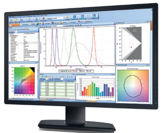
SpecWin Pro spectral analysis software.

or transmissive properties. With the Goniometer module a goniometer system, e.g. LEDGON can be controlled. The Commander module is a programming interface where measurement sequences can be created by just a few clicks.