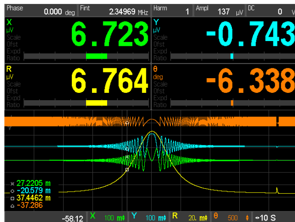
Large numeric readout with strip chart recording

The SR865A's effective dynamic reserve is simply the ratio of these two settings. For instance with a 10 nV sensitivity setting and a 300 mV input range the effective dynamic reserve of the SR865A is 3 \times 10^7 , or nearly 150 dB.