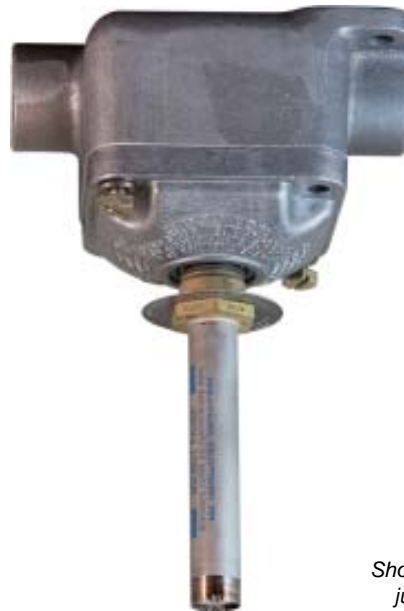
Shown with optional junction box