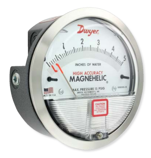
Note: Shown with optional -SS bezel