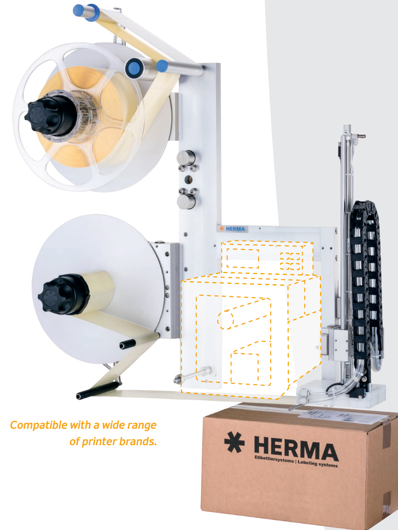
Compatible with a wide range of printer brands.