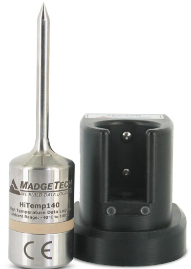
IFC400 ( sold separately )

Using the MadgeTech Software, starting, stopping and downloading the HiTemp140 is simple and easy. To use, simply place the HiTemp140 in the IFC400 or IFC406 docking station ( sold separately ). Using the software, an immediate or delay start can be chosen, as well as the reading rate. Start the data logger, remove it from the docking station and the device is ready to be deployed. Graphical, tabular and summary data is provided for analysis and data can be viewed in °C, °F, K or °R. The data can also be automatically exported to Excel® for further calculations.