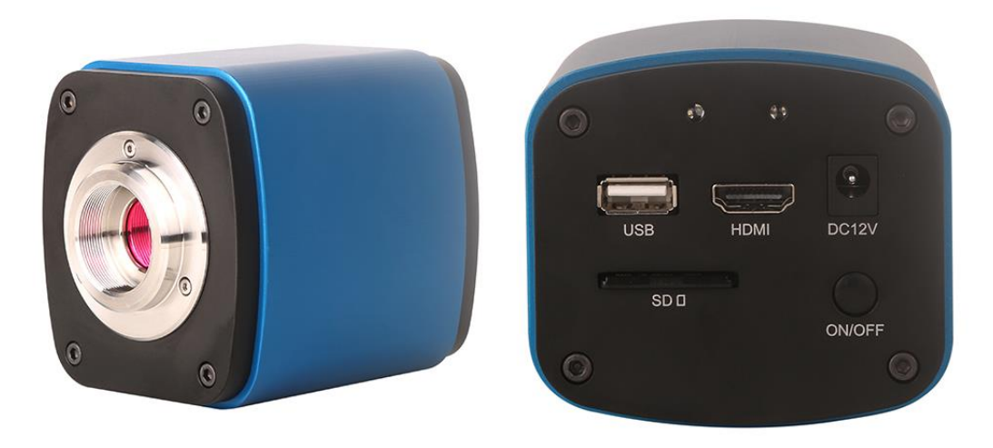
HDMI C-mount Camera and Its Back Panel