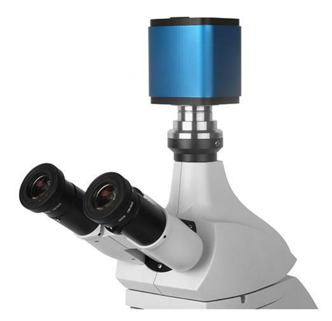
HDMI Camera and Microscope