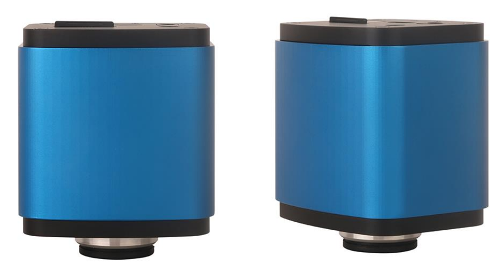
Different Views of HDMI