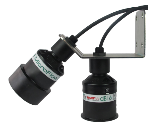
The MicroFlow-i and dBi low powered sensors for CSO Network Monitoring.

For more information on our service offerings, please visit the website or contact one of our head offices.