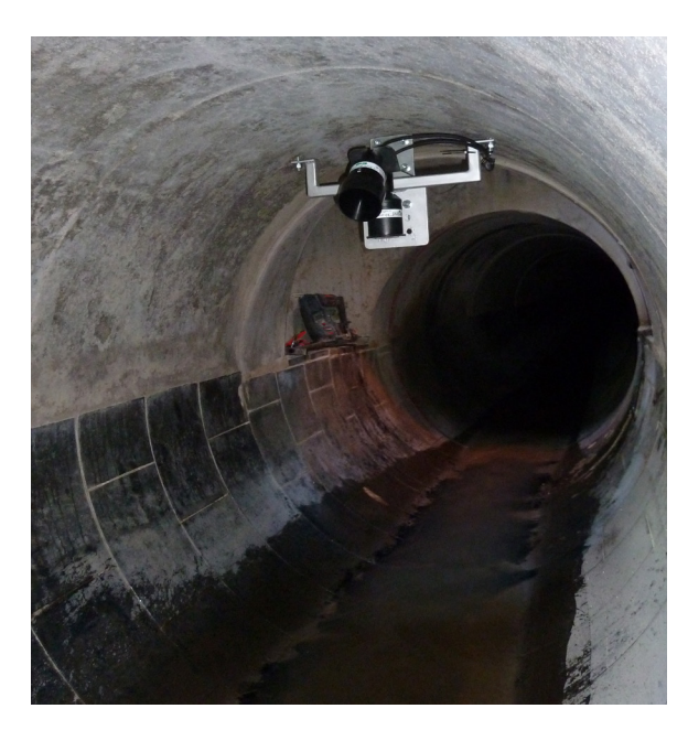
MicroFlow-i Measuring Flow Velocity

Management of pollution under flood conditions is a significant challenge and, with ever more demanding monitoring regimes, operators have implemented thousands of CSO monitoring installations and thousands more are planned, with data logging and level measurement to record spill events. Looking beyond CSO, there are good reasons to monitor flow throughout the wastewater network to identify problem areas, alert maintenance teams, and generate corrective action.