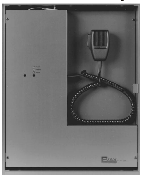
FGVAX 25 shown with Keylocked Door Removed